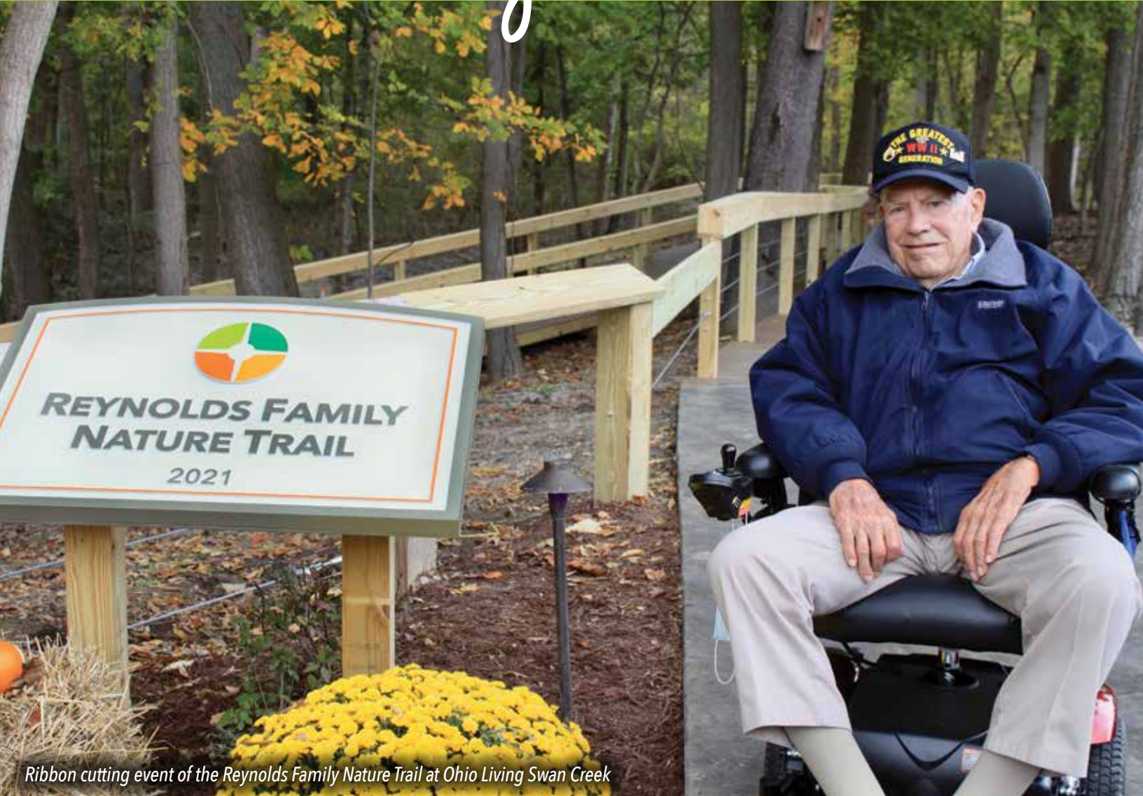
Ribbon cutting event of the Reynolds Family Nature Trail at Ohio Living Swan Creek