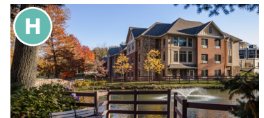
Ohio Living Rockynol Akron | 330.867.2150