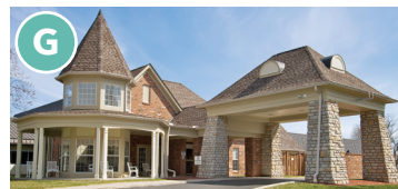
Ohio Living Quaker Heights Waynesville | 513.897.6050