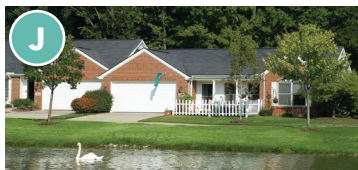
Ohio Living Swan Creek Toledo | 419.865.4445