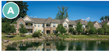
Ohio Living Breckenridge Village Willoughby | 440.942.4342