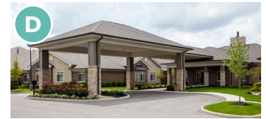
Ohio Living Ganzhorn Suites Powell | 614.356.9810