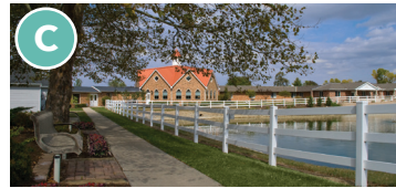
Ohio Living Dorothy Love Sidney | 937.498.2391