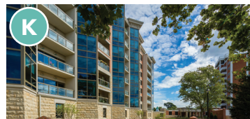
Ohio Living Westminster-Thurber Columbus | 614.228.8888