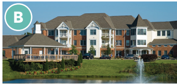
Ohio Living Cape May Wilmington | 937.382.2995