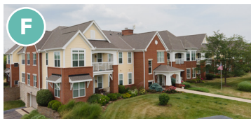
Ohio Living Mount Pleasant Monroe | 513.539.7391